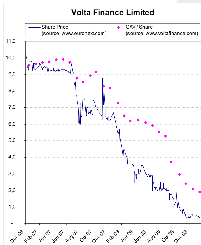
GAV and Share Price History